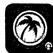
Photo capture and editing apps are a dime a dozen. But Fotor is different enough to stand out from the pack with its ease of use. All the options you get are laid out neatly at the bottom of the app, making them very accessible. There are no hidden menus and no need to dig

around for various settings. During photo capture, you have options to adjust various settings like exposure, zoom, timer and burst